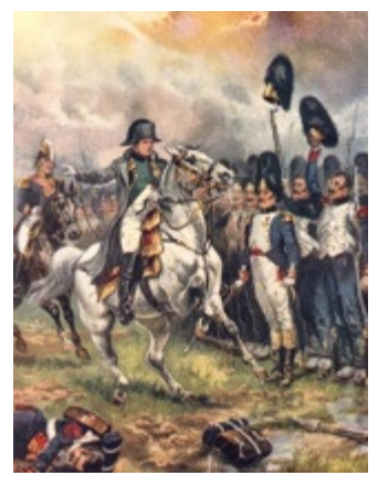
Today's military strategists can learn from Napoleon's handling of the guerilla wars his men faced while fighting in both Italy and Spain in the early 19th century

The Battle of Austerlitz in 1805 ended the so-called War of the Third Coalition, destroyed the Holy Roman Empire, and solidified Napoleon's dominance of continental Europe. All that remained was for Napoleon to consolidate his hold on those nations that had backed the wrong side in the war. One such unfortunate country was the tiny nation of Naples.