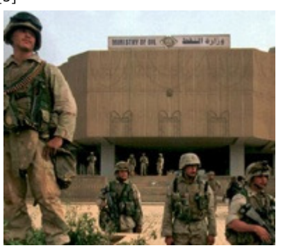
U.S. Marines guard Iraq's Ministry of Oil in Baghdad following the invasion in

Despite four years of loud protest from America, much of the Muslim world persists in believing that the US is in Iraq for its oil. The US military did little to allay this suspicion in the aftermath of the initial invasion in 2003 when it guarded the Iraqi Oil Ministry while it did nothing to prevent looting of the National Museum.