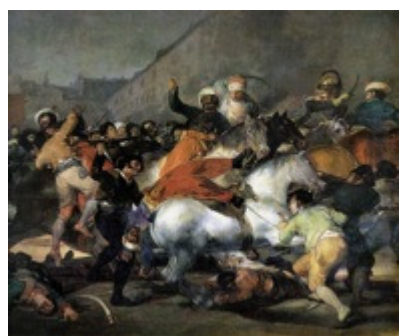
The Second of May 1808 (The Charge of the Mamelukes) by Spanish artist Francisco Goya. This painting depicts the Spanish uprising that precipitated the executions the following day and made famous in Goya's The Third of May 1808

The Spanish people, who only weeks before had greeted French armies with fanfare, rose in a general uprising against the French assault on Spanish sovereignty. All across Spain, civilians took up arms and began throwing the French out of their towns and villages. Spanish civilians and remnants of the Spanish army seized French ships in Spanish ports. On May 2, 1808, a mob of nearly 180,000 angry Spaniards marched on the garrison of 36,000 French in Madrid. The French were on the run across Spain as the security situation rapidly spun out of control. Napoleon had boasted before the campaign that 12,000 men could capture Spain. However, by the summer 1808, twice that many men were dead, the French had been handed their first defeat since the beginning of the Napoleonic Wars, and over 160,000 French soldiers were streaming into Spain to put out the growing fire.